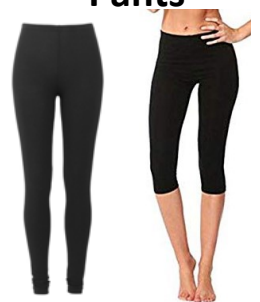
Black Leggings (Full or 3/4 Length)