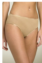
Skintone (Nude) Undies