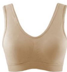
Skintone Crop Top