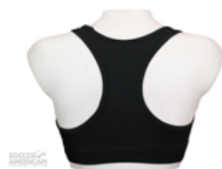
Black Crop Top

Teachers will always request that suitable underwear is worn under costumes. Exposed bra straps and bright coloured socks & underpants are NOT suitable for performances. Skintone or Black underwear is the best option.