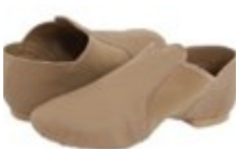
Camel Jazz Shoes

Footwear for advanced team students often changes from term to term depending on the style of dance being taught. A range of dance shoes is required, however, if students are needing to purchase new shoes we recommend 'holding off' until we announce which shoes will be used for performances. JFF will advise students at the start of each term of the required footwear for performances.