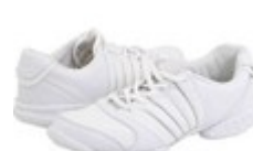
White Dance Sneakers