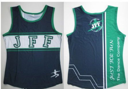
Girls Singlets: $20 Ladies Singlets: $25

The ideal garments to wear to class, Singlets & Jackets can be ordered & purchased from desk staff.