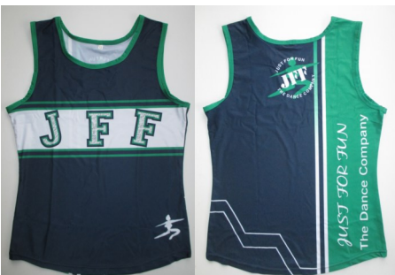
Girls Singlets: $20 Ladies Singlets: $25

The ideal garments to wear to class, Singlets & Jackets can be ordered & purchased from desk staff.