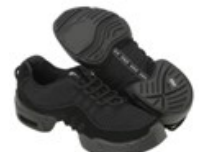
Black Dance Sneakers