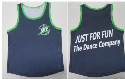
Boys Singlets: $20