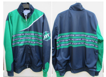
Children's Size Jacket: $45 Adults Size Jacket: $55