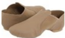
Camel Jazz Shoes

Footwear for advanced team students in Yellow (Adv), Bronze, Silver, Gold & DancePro+ often changes from term to term depending on the style of dance being taught. A range of dance shoes is required, however, if students are needing to purchase new shoes we recommend 'holding off' until we announce which shoes will be used for performances (no point in buying them until you need them!). JFF will advise students at the start of each term of the required footwear for performances.