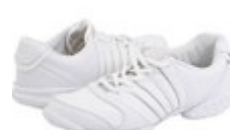
White Dance Sneakers