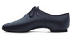
Black Jazz Shoes